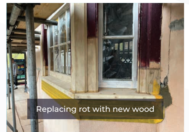
Replacing rot with new wood